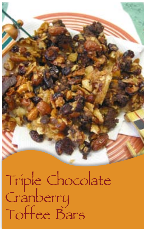
Triple Chocolate Cranberry Toffee Bars