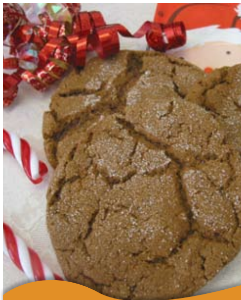
MaMa's Soft Molasses Cookies