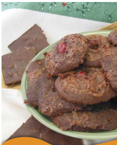
Chocolate Covered Cherry Cookies