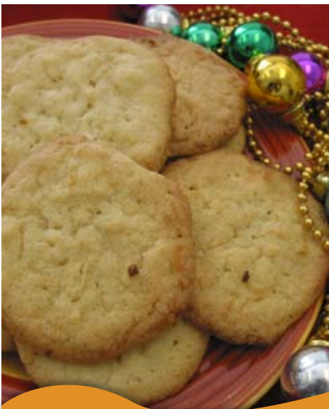
Swedish Coconut Cookies