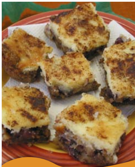
Cranapple Spice Cream Bars