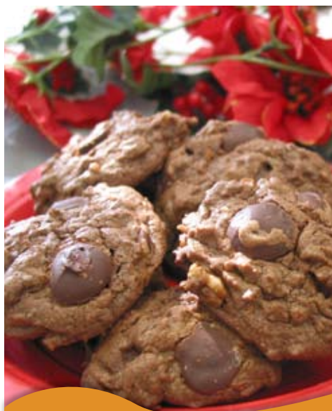
Mocha Java Delight Cookies