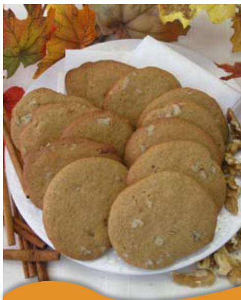
Cinnamon Nut Refrigerator Cookies