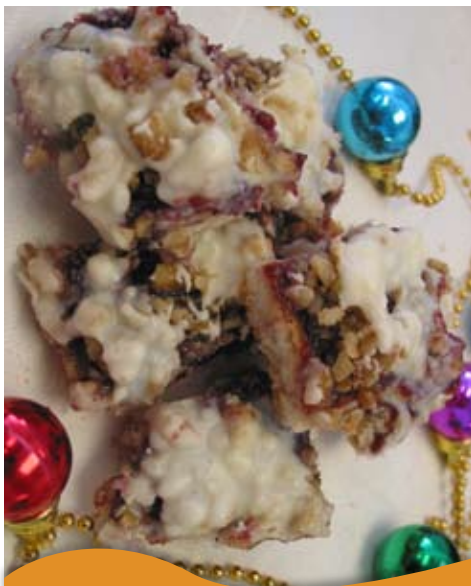
Raspberry Jam Bars