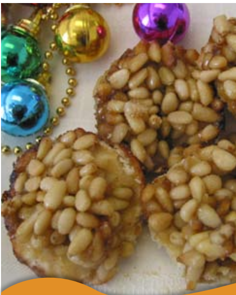
Pignoli (pine nut) Treats