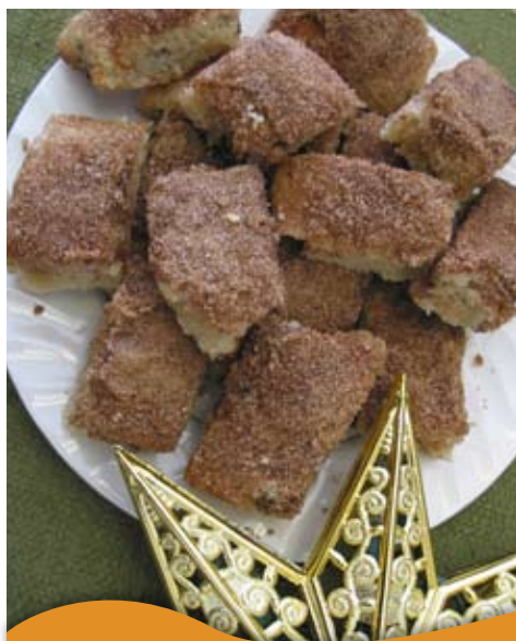
Easy Mandel Bread Cookie