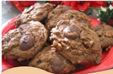
Mocha Java Delight Cookies

Dozens of bakers entered our holiday cookie contest. With so many great recipes, our judges found it difficult to select just three winners. Try them all and you be the judge! Here are the top three winners.