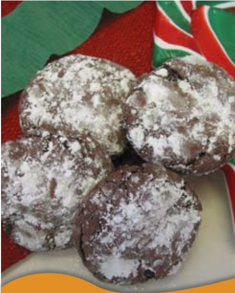
Easy Chocolate Chewies