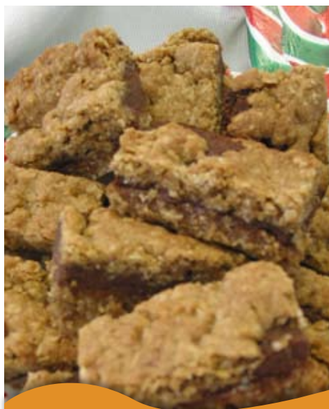
Marvelous Munch Bars