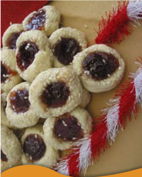
Sesame Seed Cookies