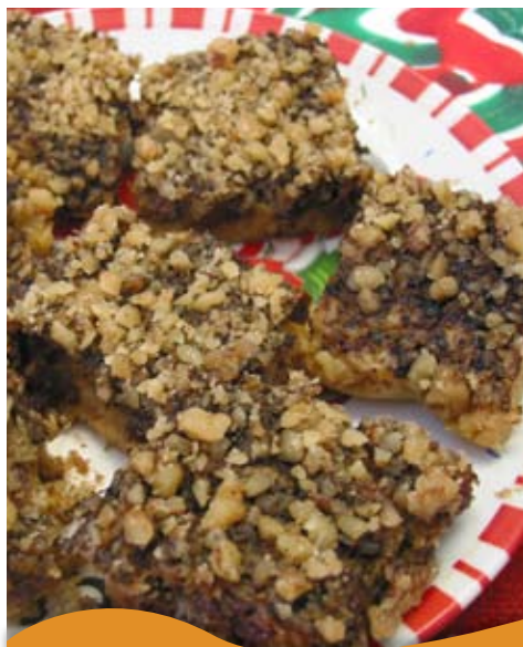
Cherry Walnut Bars