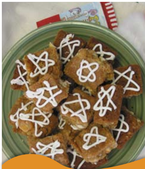
White Chocolate Macadamia Cookie Squares