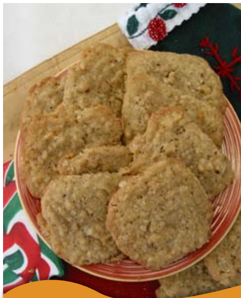
Cornflake Crunch Cookie