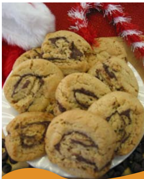
Peanut Butter Swirls