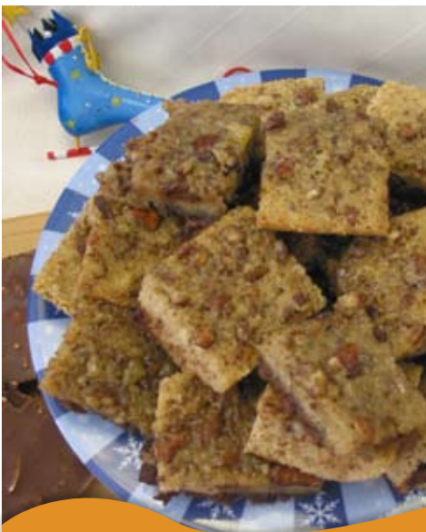
Chocolate Nut Bars