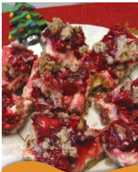
Cherry Cheese Bars