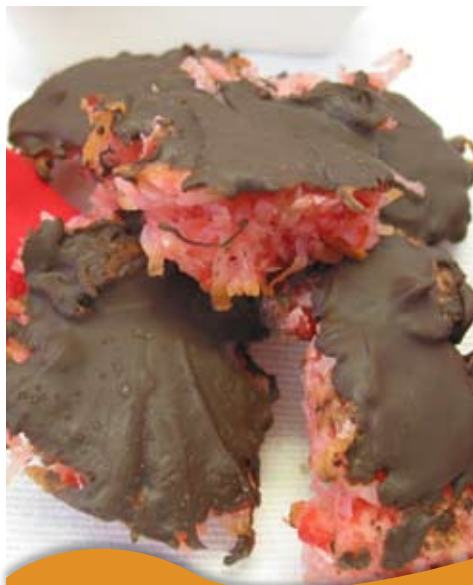
Heavenly Coconut Macaroons