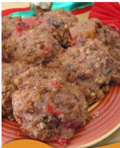
Christmas Holiday Fruit Cookies