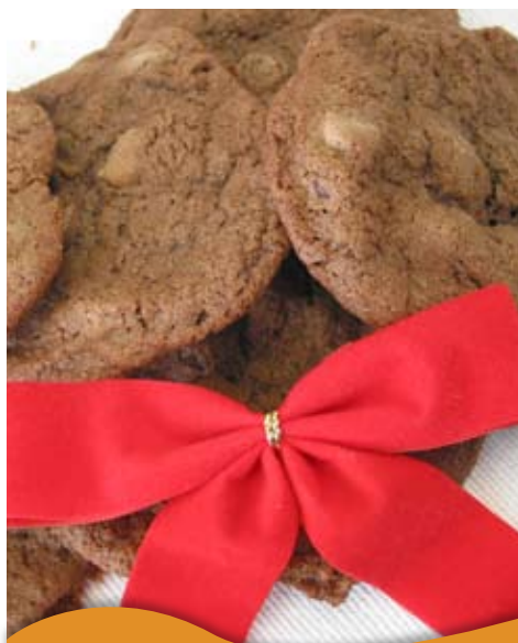
Chocolate Chocolate Chip Cookies