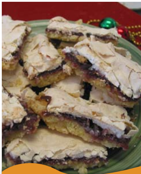
Raspberry Snow Bars