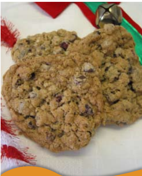
Cowboy Cookies with a Twist