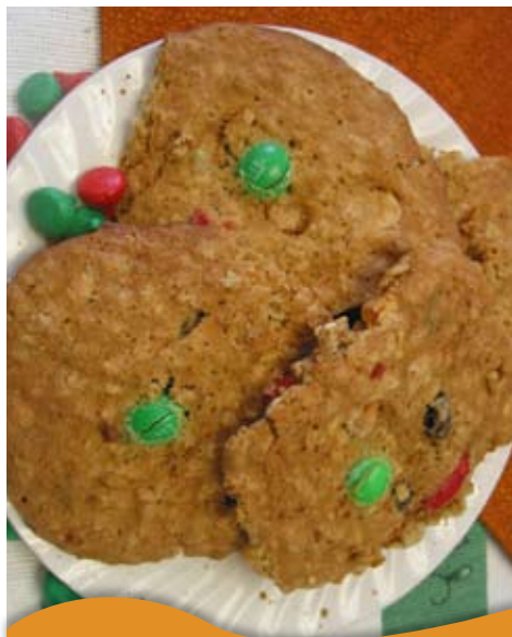
Holiday Kitchen Sink