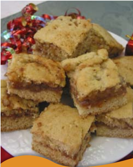
Adele's Mandel Bread