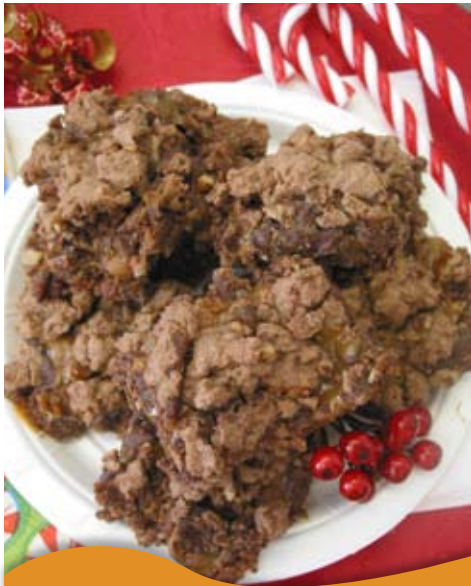
Knock Your Socks Off Bars