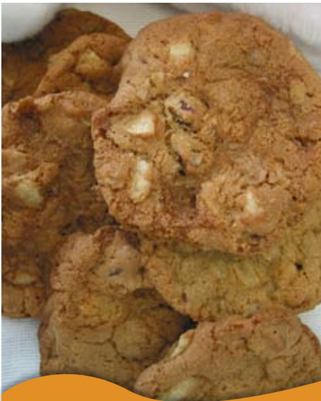
Potato Chip Cookies