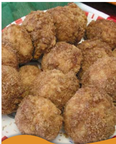
Italian Rum Butter Balls