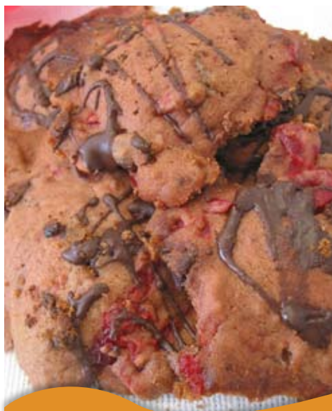
Black Forest Cookies