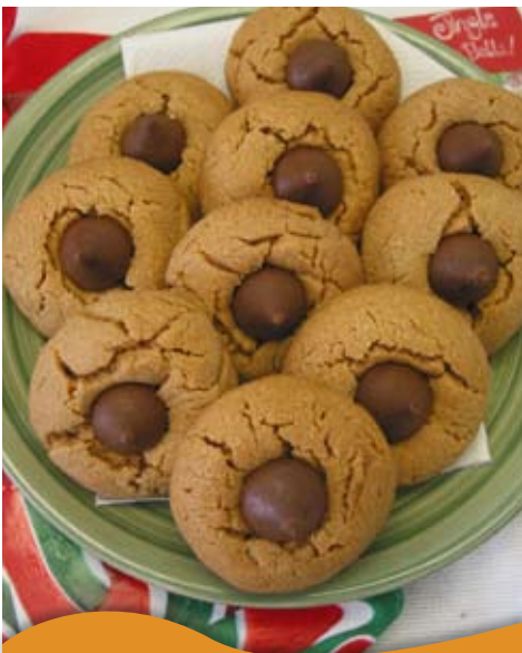
Easy PB Kisses