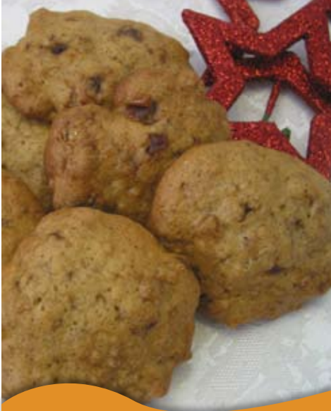
My Christmas Cookie