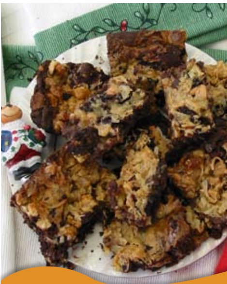
Almost Candy Bars