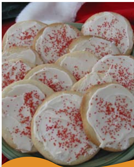
Alice Knapp's Christmas Cookies