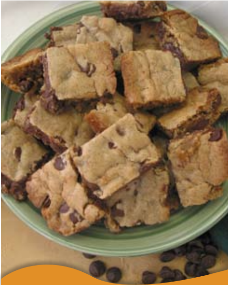
Chocolate Cinnamon Bars