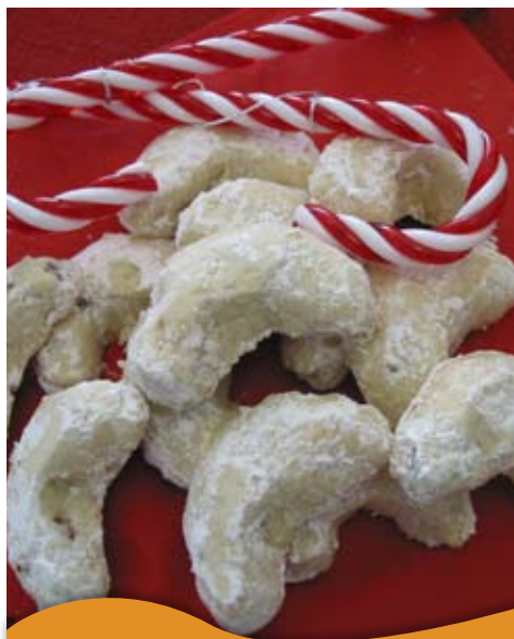
Mexican Pecan Crescents