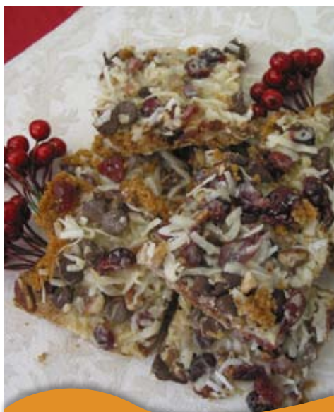
Cranberry Holiday Bars